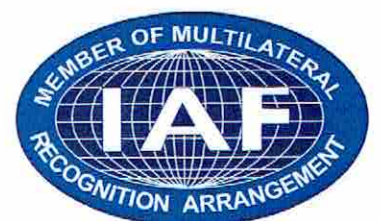
Vice President - AJA Registrars Inc.

This certificate is issued in respect of the locations & scope of registration detailed in the Associated Registration Schedule. This certificate is the property of AJA Registrars Inc., 2nd Floor JD Tower, Commerce Avenue, Madrigal Business Park Ayala Alabang, Muntinlupa City 1770, Philippines and must be returned on request. A member of the AJA Group of Companies