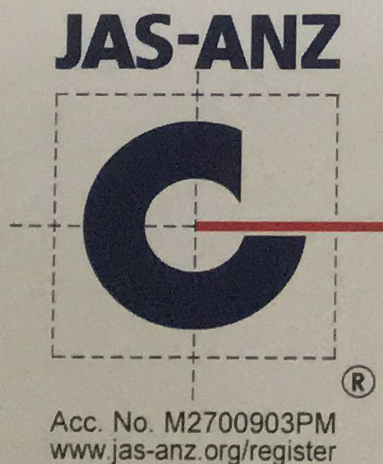
Vice President - AJA Registrars Inc.