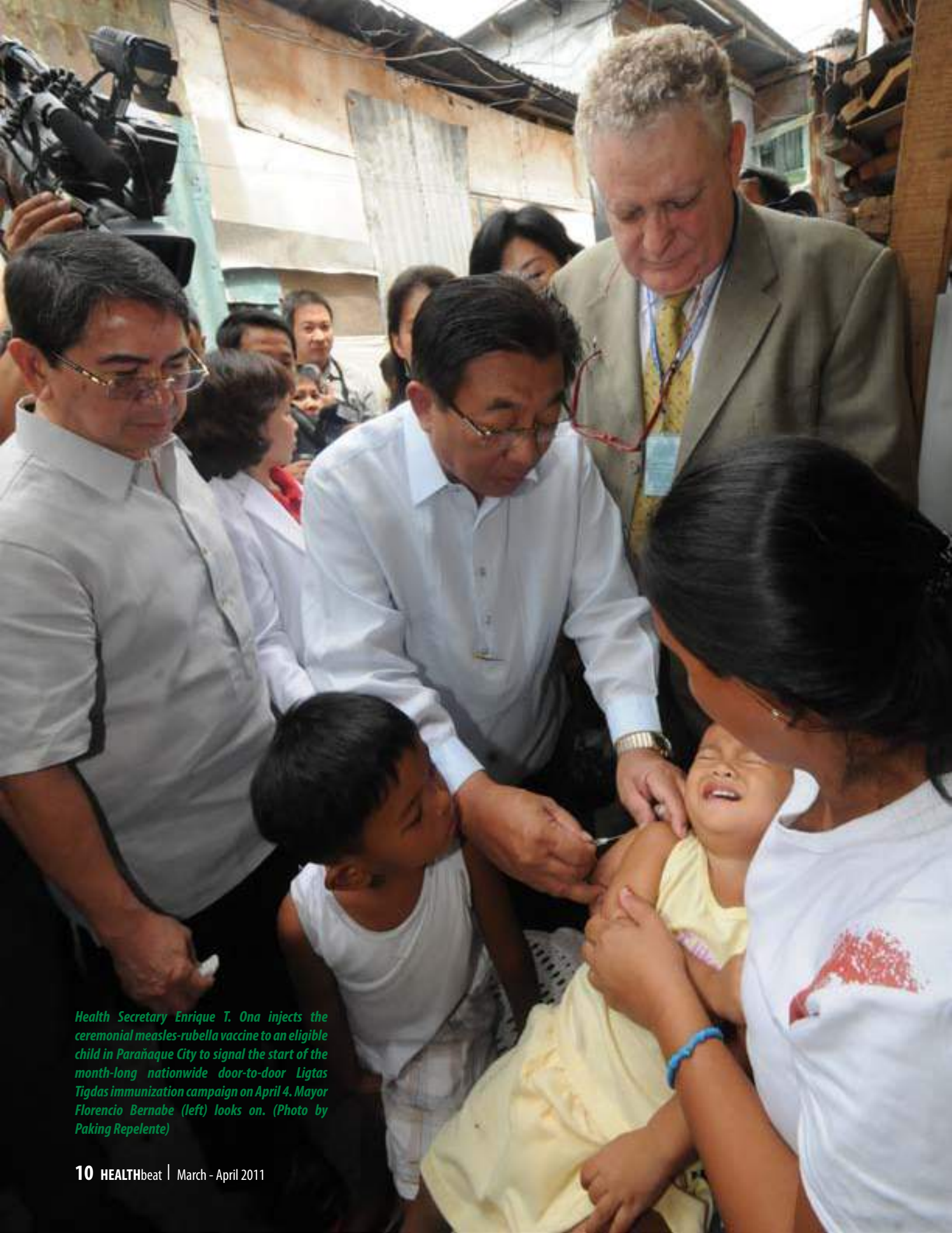
Health Secretary Enrique T. Ona injects the ceremonial measles-rubella vaccine to an eligible child in Parañaque City to signal the start of the month-long nationwide door-to-door Ligtas Tigdas immunization campaign on April 4. Mayor Florencio Bernabe (left) looks on.