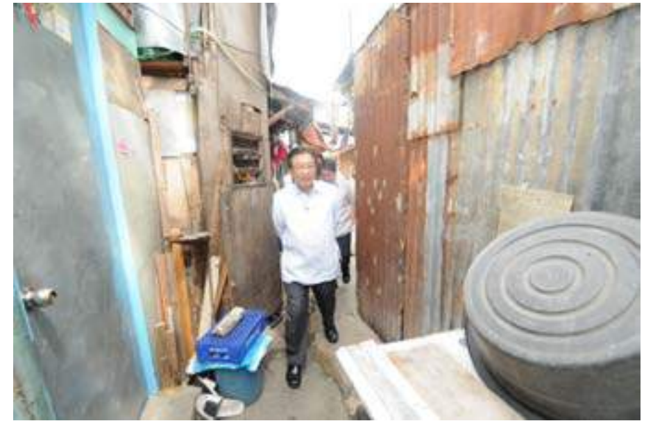
As what Health Secretary Ona emphasized, Ligtas Tigdas is a strictly a door-to-door campaign.

Eligible children of mobile and roaming families with no house or no permanent house shall be identified and given immunization. All eligible children found in the parks, playgrounds, streets, markets, and other public places shall be