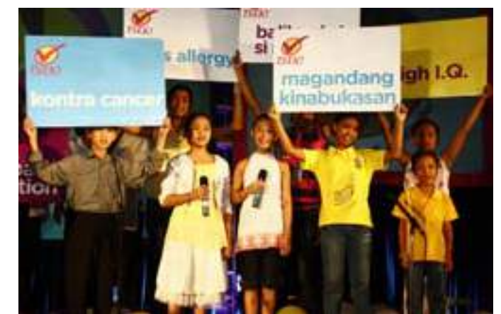
BREASTFEEDING TSEK - the start of a new breastfeeding movement.