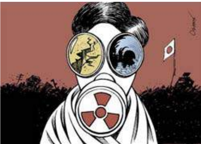
Japan's triple disasters: earthquake, tsunami and radiation spill. (Editorial cartoon circulates in the Internet.)

Shower or bathe with warm, not scalding hot, water and soap. Notify authorities that you may have contaminated clothing and personal belongings to be