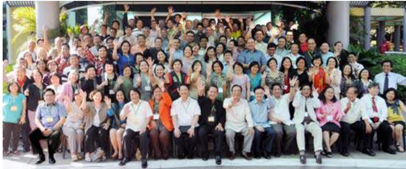
The DOH leaders, responsible for moving the Aquino Health Agenda on Universal Health Care to reality, during the 2nd National Staff Meeting in Antipolo City on April 6-8.

volunteer nurses under the Registered Nurses for Health Enhancement and Local Service (RNheals), a priority project of the Aquino Health Agenda using the framework of Universal Health Care.