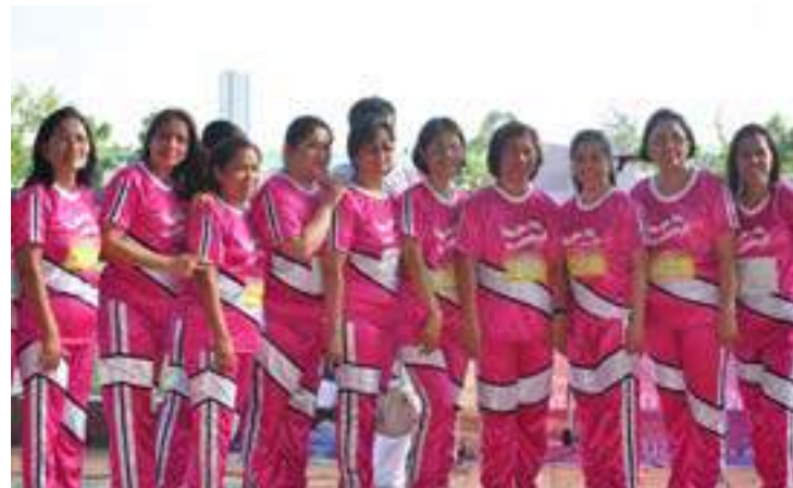
TOP: They're not the Pink Sisters, but they surely are worthy of being named "Best in Uniform." Aba, tumakbo naman kayo, 'Day! RIGHT: Haaay, malayo pa ba? Lawit na mga dila namin. Tumabi kayo, mga Pink Sisters, dadaan kami...