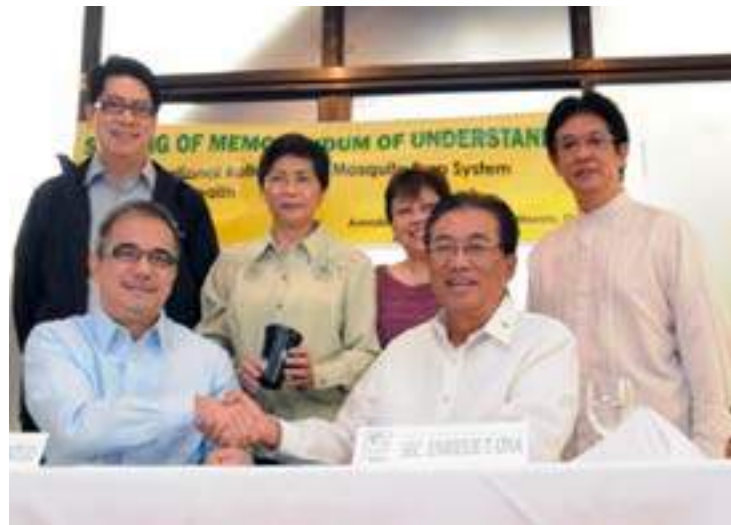
Science and Technology Secretary Mario Montejo (seated left) and Health Secretary Enrique T. Ona (seated right) sign a Memorandum of Understanding for the roll-out of ovi/larvicidal traps for Aedes mosquitoes for dengue vector control.

The Department of Science and Technology (DOST) will provide 700,000 OL mosquito trap kits to selected households nationwide in identified sites with high dengue incidence. These households will also be given free OL pellets monthly for six