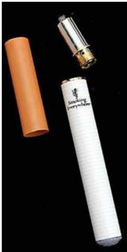
SMOKE EVERYWHERE?? We hope not.

The DOH also follows the World Health Organization (WHO) recommendation of not considering e-cigarette to be a form of "legitimate therapy for smokers trying