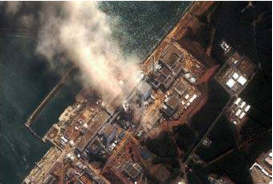
Nuclear power plant meltdown following the devastating earthquake and tsunami in Japan. (Photo circulates in the Internet.)

These necessary actions depend on the estimated exposure (i.e., the amount of radioactivity released in the atmosphere and the prevailing meteorological conditions such as wind and rain. The actions include