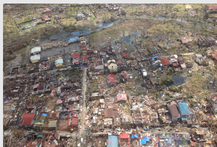
Helicopter shot taken by Asec. Ubial as she approach the Leyte Government Center in Palo for the first time. Showing a DOH Region 8 office with miraculously very little damage compared to other government buildings in the area. This structure became the home and refuge of more than 100 DOH responders at a time