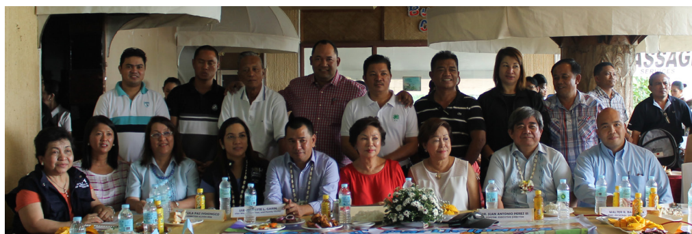
LCE DIALOGUE ON MDGs Local Chief Executives met to address matter on the attainment of the Millennium Development Goals (MDGs) 4, 5, and 6 of their respective localities last July 1

THE DEPARTMENT of Health (DOH) launched the DOH on Wheels: Kalusugan Pangkalahatan or KP Roadshow, on May 8, 2014. KP is the Aquino administration's universal health care agenda, which seeks to improve health outcomes like maternal and child health at the least possible cost.