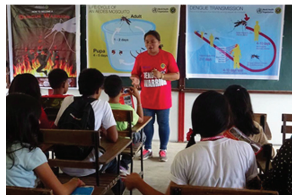
DENGUE AWARENESS CAMPAIGN A collaboration among Local Government Units (LGUs), the National Government through the Department of Health Regional Office VII (DOH – RO VIII), the World Health Organization, International Non-government Organizations (INGOs) and the public sector was launched on June 26 in Tacloban to call for vigilant action to protect vulnerable communities from dengue