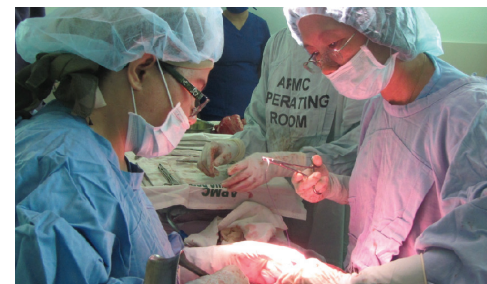
PMC OUTREACH PROGRAM There was a total of twenty (20) major gynecologic cases operated in the two-day surgical mission as part of the Amai Pakpak Medical Center and POGS Regional X Annual Community Outreach Program. The surgical mission team consisted of twenty-three (23) obstetricians-gynecologists surgeons, one (1) general surgeon, eight (8) anesthesiologists, and nineteen (19) operating room nurses. BTL surgical team was composed of five (5) surgeons, six (6) nurses, and two (2) nursing attendants

Activities included were surgical operation of major gynecologic cases, bilateral tubal ligation, breast and cervical cancer screening, prenatal checkup for the high risk pregnancy, ultrasound services, and health-related lectures such as Adolescence Health Issues and Perspectives (AHIP) and Reproductive Tract Infection (RTI) for the youth and health providers respectively.