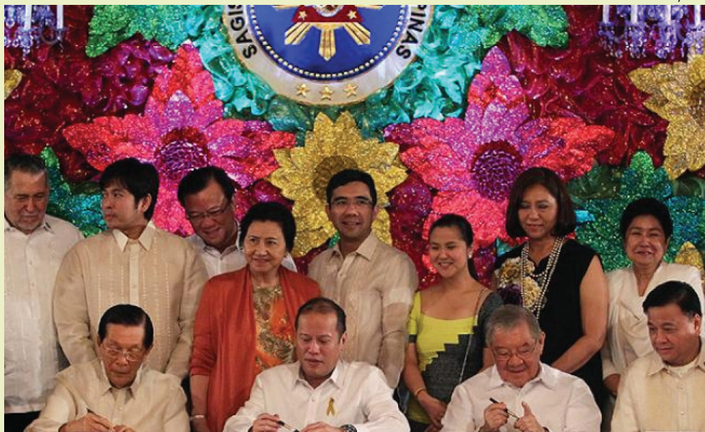
SIN TAX LAW SIGNING President Simeon Aquino III signed the Republic Act 10531 or the Sin Tax Reform Law on December 20, 2012 in Malacañan with the Department of Health, health professionals, medical societies, patients' groups, academe, and other health advocates from civil society as witnesses

is, some people were not yet enlisted or were not yet identified as those belonging to the said category.